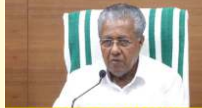
COVID-19 LOCKDOWN SUGGESTIONS FROM CMS

അഭിവന്ദ്യനായ നമ്മുടെ മുഖ്യ മന്ത്രി എന്നും വൈകുന്നേരമുള്ള തന്റെ പത്രസമ്മേളനത്തിൽ പറഞ്ഞു, ലോക്ക് ഡൗൺ കാലത്തു സമയം ക്രിയാത്മകമായി ചിലവഴിക്കാൻ വഴികൾ കണ്ടുപിടിക്കണമെന്നു. ചിലവ് ഒട്ടുമേ ഇല്ലാത്ത ഒരു ടൈം പാസ് പരിപാടിക്കാണ് ഞാൻ ഇവിടെ രുനിയുന്നത്. ആകെ വേണ്ടത് പത്രവും, ഇത്തിരി പശയും. മൈൻ കോണ്ട് ഈ പശ ഉണ്ടാക്കിയെടുക്കാം.