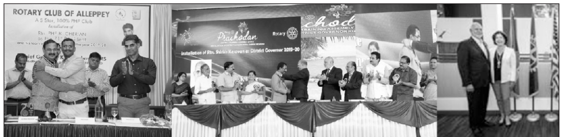
Alleppey (28th June 2019)