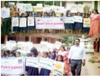
RC of Alpy & RC of Coir city of Zone 20 conducted hand Washing awareness program in connection with WINS in Govt LPS Alpy