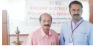
Polio work shop at Kottayam